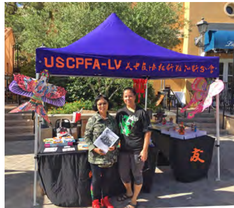
Las Vegas chapter, 2019.