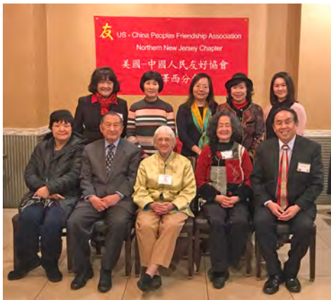
Northern New Jersey chapter.