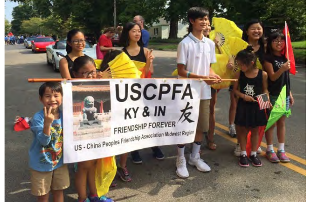
Owensboro/Evansville chapter, 2017.